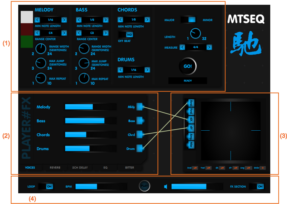
Fig. 2. GUI Design and Sections

The basic sections of the GUI are pointed out in Figure 2. In the upper part of the GUI, section (1) represents the generator controls. The parameter values are sent to the generator proxy in real-time, but as described above, they do not come into effect until the generation is triggered by the GO button on the right.